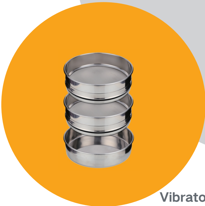
Vibratory Sieve Shaker SS2000